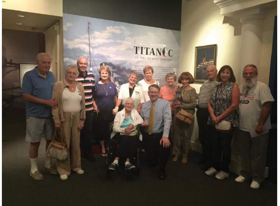
Last year, our S.A.M. group had a great time touring the Titanic Exhibit at the Reagan Library

On Wednesday, April 11, at 1 PM (after Lunch Bunch), we will carpool to the Reagan Library to view the exhibit. This is its only Southern California stop on an international tour that has drawn more than a million visitors.